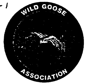
EXHIBIT 3-1 Wild Goose Association

The International Loran Radionavigation Forum